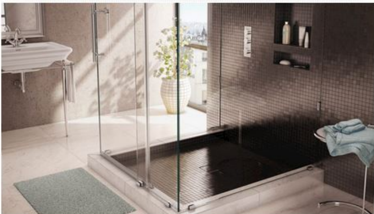
Tile Redi® Introduces Wonder Drain

KEYWORDS glass tile / mosaic tile / porcelain / EMAIL / PRINT / REPRINTS / f / t / in / MORE / TEXT SIZE+ tile