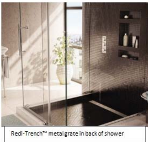
Redi-Trench™ metal grate in back of shower