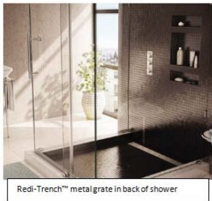
Redi-Trench™ metal grate in back of shower