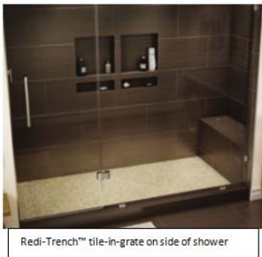
Redi-Trench™ tile-in-grate on side of shower

Farrell Gerber, Executive VP Sales of Tile Redi® stated, "Redi-Trench™ is the only linear drain system completely integrated into a leak-proof, mold-free shower pan. Designers have the choice of selecting either tile-in-grate or non-tile-able versions. We know this product meets the needs of so many shower applications, and is an ideal item to be specified for hotels with a sizable number of guestrooms."