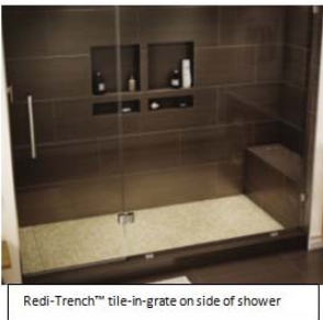
Redi-Trench™ tile-in-grate on side of shower

Farrell Gerber, Executive VP Sales of Tile Redi® stated, "Redi-Trench™ is the only linear drain system completely integrated into a leak-proof, mold-free shower pan. Designers have the choice of selecting either tile-in-grate or non-tile-able versions. We know this product meets the needs of so many shower applications, and is an ideal item to be specified for hotels with a sizable number of guestrooms."