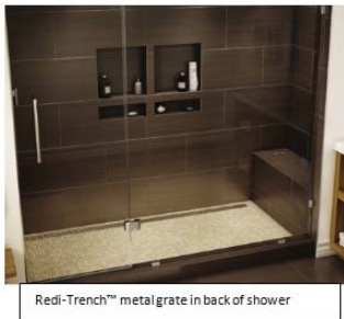
Redi-Trench™ metal grate in back of shower

Tile Redi®, world-leading manufacturer and marketer of pre-formed, one-piece shower pans and related accessories, received the award for "Surfaces 2013 Best New Product" sponsored by Floor Tends and Tile magazines. The winning product, Redi Trench™, is an incredibly exciting marriage of design and function.