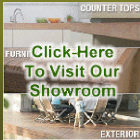
Rubio Monocoat® - 34 Colors