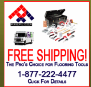
Pro's Choice for Online Tools